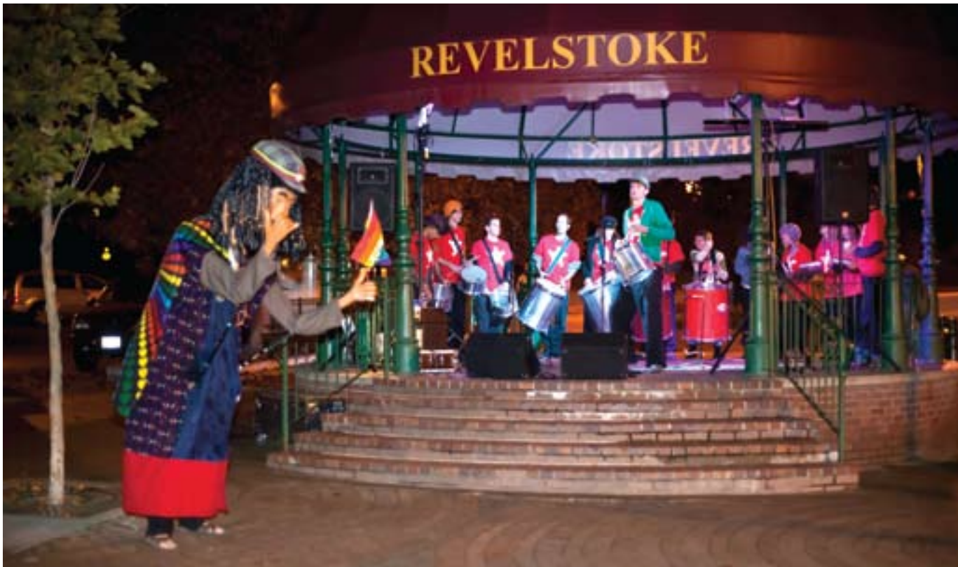
The Moving Mosaic Community Samba Band plays for the crowd in Grizzly Plaza during the evening of Basin culture.

The day’s learning and discussions ended with a surprise: the Moving Mosaic Community Samba Band from Nelson brought everyone to their feet as they wove through the crowd with their upbeat music and movement. This kicked off an evening of cultural entertainment, during which Symposium participants and community members enjoyed a self-guided tour that included excursions to Revelstoke’s arts, culture and heritage venues, a viewing of Basin films, storytelling and a showcase of music by performers from across the Basin.