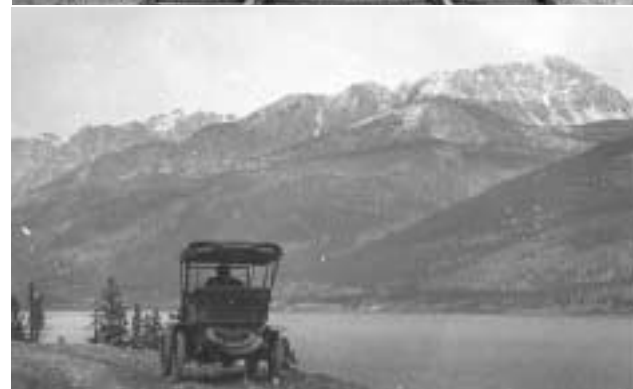
Top left: Unknown fisherman catching two Dolly Varden trout in the Elk River. Top right: Town of Waldo. Middle: Historic bridge in Fernie. Bottom: Tourists at Columbia Lake.