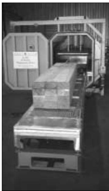
HeatWave's E-field vacuum kiln for drying wood.

At the beginning of 2001, CBT started collecting rent on its Columbia Basin Building in Castlegar and a portion of the building was sold to the City of Castlegar. Through its real estate portfolio, the CBT also has $1.3