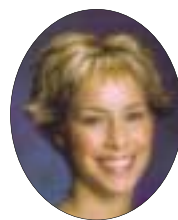
Kaitlin Pasqualotto Trail