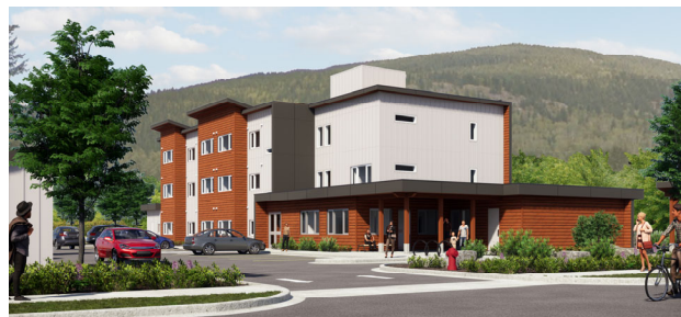
Revelstoke / Humbert Street 22 homes for people with moderate + low incomes working in hospitality