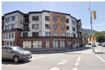
Nelson / Hall Street 47 homes for low to moderate income families + seniors