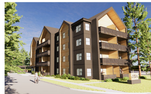
Sparwood / Evergreen Crescent 30 homes for low-income individuals, families + seniors)