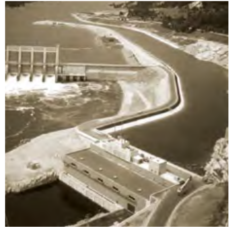
Arrow Lakes Generating Station.