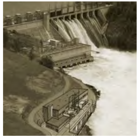
Waneta Dam and Expansion.