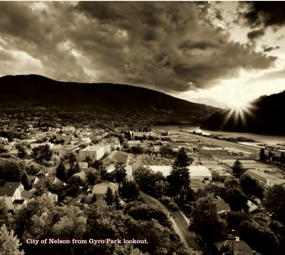
City of Nelson from Gyro Park lookout.

To manage Columbia Basin Trust's assets for the ongoing economic, environmental and social benefit of the region, without relieving governments of any obligations in the region.