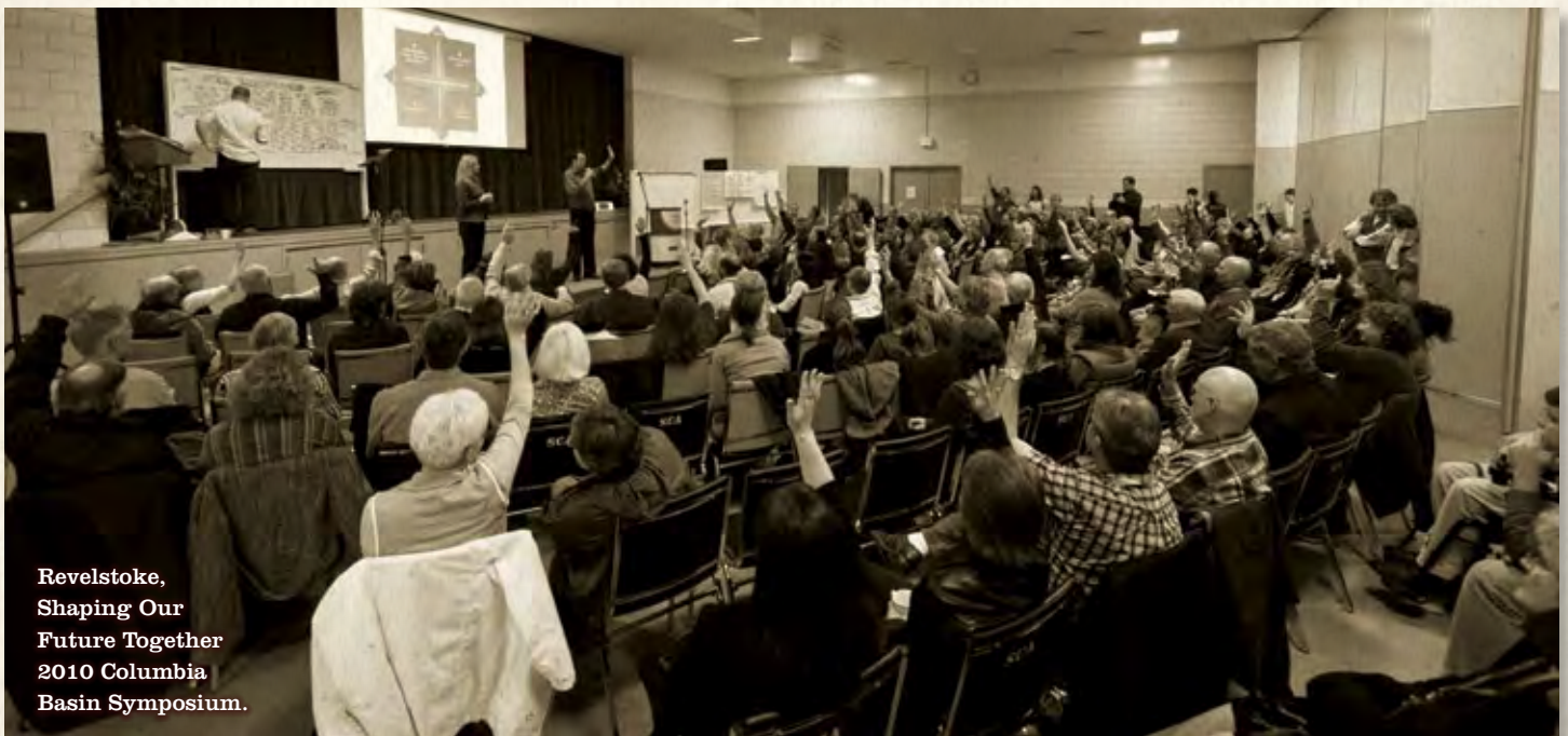
Revelstoke, Shaping Our Future Together 2010 Columbia Basin Symposium.